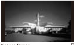
Kosuge Prison (Tokyo Detention Center) [1929] YS Shigeo Kanbara (Building Section of Judicial Office)