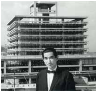
Commemorative photograph of Kenzo Tange taken just before completion (Spring 1958)