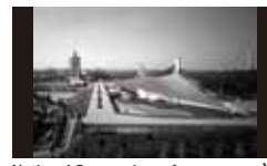
National Gymnasiums for Tokyo Olympics [1964] YS Kenzo Tange