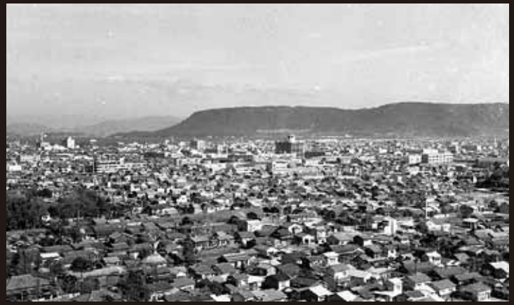
Kagawa Prefectural Government Office at the time of completion (center) and Takamatsu City (1958)

The East Building of the Kagawa Prefectural Government Office was completed in 1958 (the original main building and east building, design by Kenzo Tange) and is seen as a representative piece of post-war Japanese architecture. Even now it receives a steady stream of visitors. With design plans, sketches, and photographs from the time of completion, this exhibition will look at the ideas behind its conception and design, how it was completed, and the contribution it has made to Japanese architectural history.