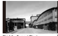
Chichibu Cement Plant (Taiheiyō Cement Plant) [1956] YS Yoshiro Taniguchi + Nikken Sekkei