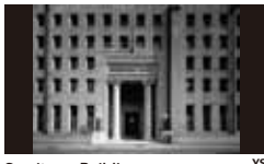
Sumitomo Building [1926] YS Sumitomo Eizen Design Office Eikichi Hasebe / Kenzo Takekoshi