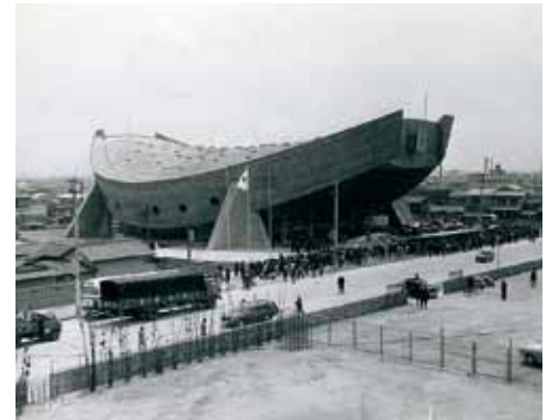
Kagawa Prefectural Gymnasium (1964) / Owned : Kagawa Prefectural

The works of Kenzo Tange that remain in the various areas of the Setouchi serve to inspire architects working here, and have given rise to a number of new distinctive works. His buildings have become the influential foundation of the architectural culture of the Setouchi area.