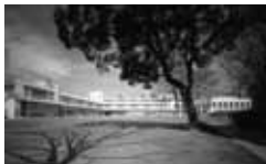
Keio Gijyuku Grade School [1937] YS Yoshiro Taniguchi + Sone Chujo Architects