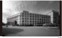
Tokyo Central Post Office [1931] YS Tetsuro Yoshida (Building Section of Post Telephone Telegraph Office)