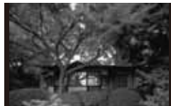
Chochikukyo [1928] YS Koji Fujii