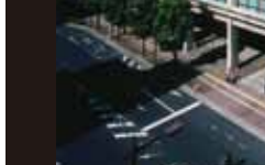
Kagawa Prefectural Government Office [1958] TM Kenzo Tange