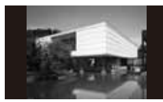
The Museum of Modern Art, Kanagawa [1951] EK Junzo Sakakura