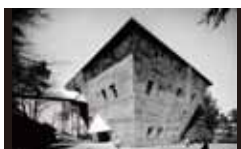
Inter-University Seminar House [1965] EK Takamasa Yoshizaka (AtelierU)