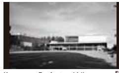
Kanagawa Prefectural Library and Music Hall [1954] EK Kunio Mayekawa