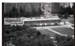
Hiroshima Peace Center [1952] EK Kenzo Tange Important Cultural Properties