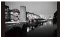
Palaceside Building [1966] EK Nikken Sekkei (Shoji Hayashi)