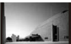
Ube City Public Hall [1937] YS Togo Murano Important Cultural Properties