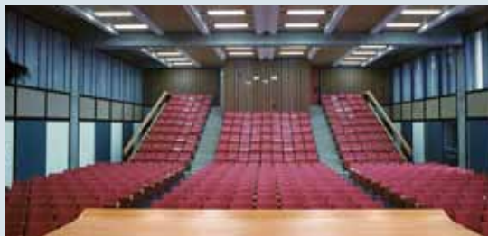
Owned : Kagawa Prefectural

At the time many desks were produced in a geometric style which utilized the shape of the materials. This photo shows Governor Kaneko inspecting the production of the Aji granite desk.