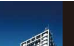
Gunma Music Center [1961] YS Antonin Raymond