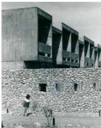
Ichinomiya Row Houses, Takamatsu (1960-64) Not extant / Photo: Kouji KAMIYA