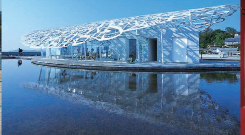
Jaume Plensa - Ogijima's Soul