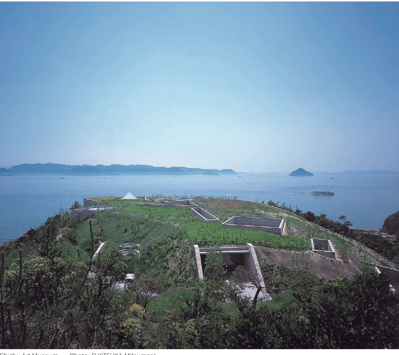
Chichu Art Museum

30 minutes by ferry from Takamatsu Port. http://benesse-artsite.jp/