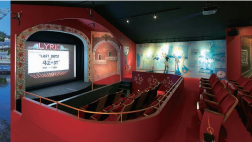
Yoichiro Yoda ISLAND THEATRE MEGI