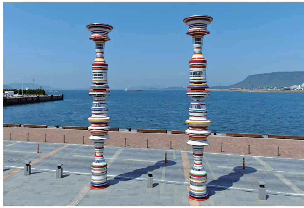
Shinji Ohmaki Liminal Air -core-