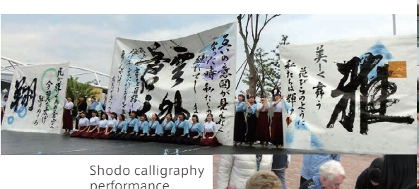
Shodo calligraphy performance demonstration and workshop

In addition to the welcome ceremony and farewell event, the sprit of hospitality for which Kagawa is known can be experienced through various exchange events.